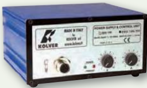
EDU1BL/SG Control unit with signals

All Kolver screwdrivers work in combination with a control unit acting as an AC to DC transformer and torque controller. The electronic control circuit cuts the power supply to the motor as soon as the pre-set torque has been reached. The EDU1BL, and EDU1BL/SG control units for KBL screwdrivers feature maintenance free state-of-the-art electronics with no wearing components. They come standard with the torque knob to adjust the torque (from 60% to 100%) of current control tools and a green LED which indicates when the control unit is on. EDU1BL/SG control unit works with KBL..FR/S or KBL..FR/CA and it additionally features signals for reached/not reached torque, pressed lever and remote start/reverse. A double output connector (Dock02 or Dock02/S for models with signals) is also available for operators using two screwdrivers at the same time. KBL..FR screwdrivers work in combination with our standard EDU1FR controllers. This option will allow existing customers to replace FAB & RAF drivers with no need to replace controllers.