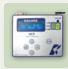
ACE SCREW COUNTER (see page 24)