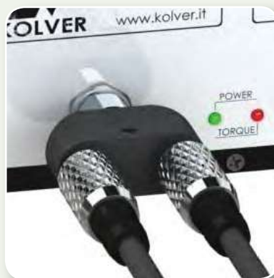
DOUBLE OUTPUT CONNECTOR FOR KBL

A double output connector is available for operators using two KBL screwdrivers in the same working area. Model DOCK02 (code 020035) is meant to be used with KBL..FR, while model DOCK02/S (code 020035/S) is to be used with KBL..FR/S (with signals) or KBL..CA (for automation). The two screwdrivers can be used at the same time.